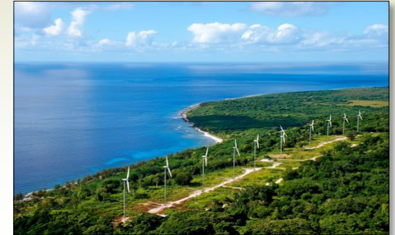
Windmill emi yus blong prodium elektrisiti blong kivim laet long Devils Point, Efate.

Yusum windmill blong genereitem elektriciti emi fren wetem envaeromen mo help katem daon helps to reduce GHG emission.