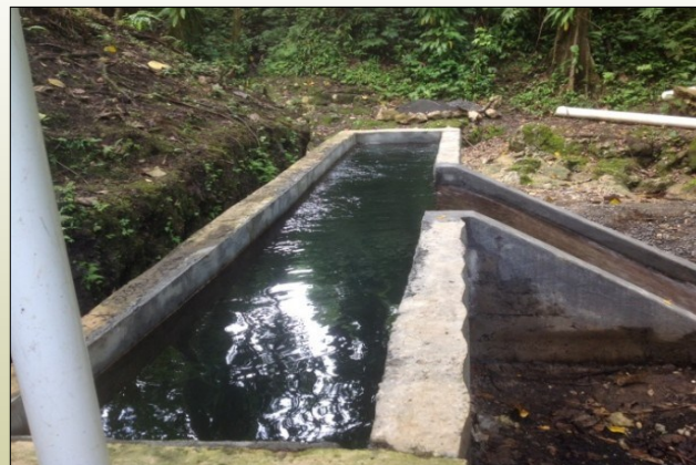
Wan mini hydro system oli yusum blong prodium electrick long wan village insaed long Vanuatu

Yusum Micro hydro pawa blong genereitem elektrisiti, katem daon namba blong ol GHG iko antap long ea.