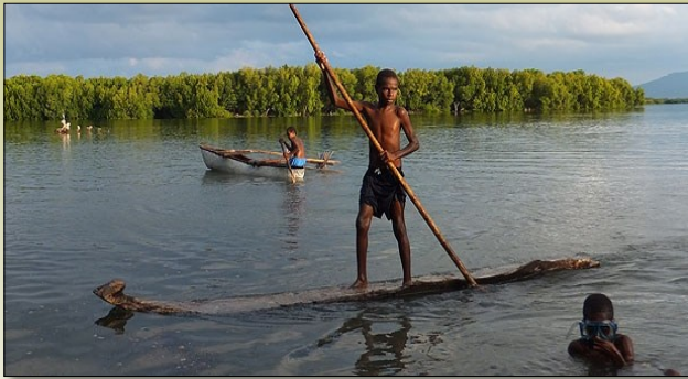
Usum sastenebol transpot blong travel olbaot blong save protektem coastal habitats insaed long Vanuatu.