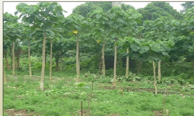
Ol tri we oli planem long Vanuatu.

“AKSEN BLONG KATEMAOT OL TOTI KAS WE I STAP KAMAOT MO KO ANTAP