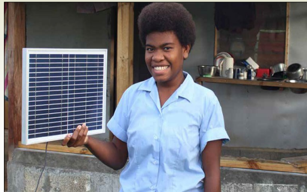
Wan skul student I holem wan solar panel we oli yusum blong prodium laet olsem electricity pawa long skul blong hem.

Jip eneji, emi fren wetem invaeromen mo emi katem daon amaon blo GHG iko antap long ea.