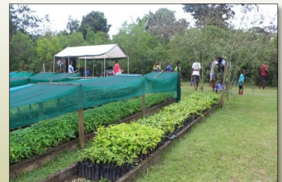
Neseri blong ol tri seedlings blong planem back ol tris long komunitis insaed long Vanuatu.